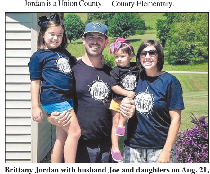
2017 - Eclipse Day.